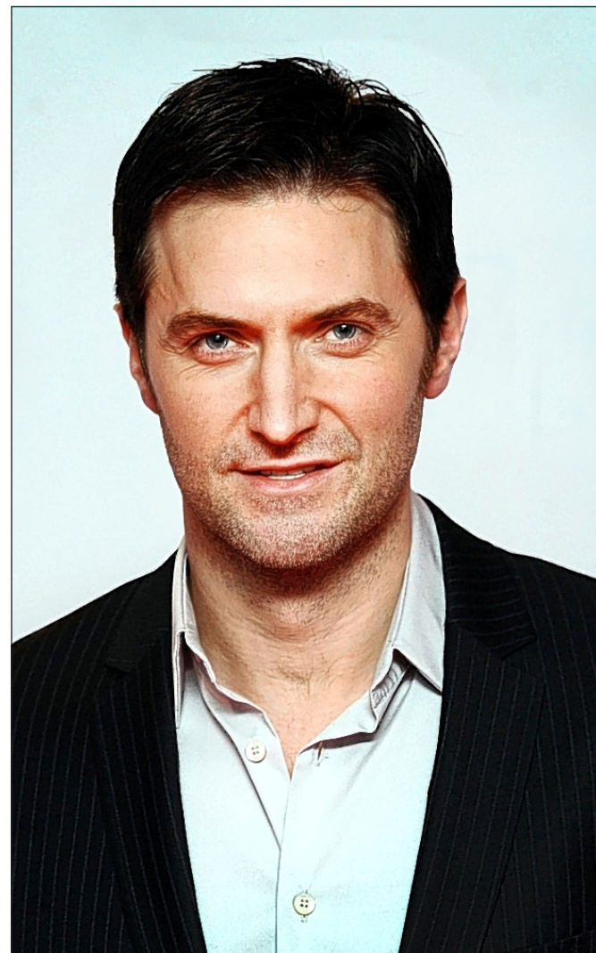
STARRING ROLE: Richard Armitage is interested in the story